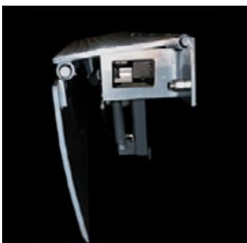
Stored traffic position

The MD-CH Series hydraulic edge-of-dock leveler from Blue Giant is ideally suited for applications where installation of pit levelers is not feasible or where standard fleet bed heights are serviced at the loading dock. The MD-CH Series is easily installed to the dock face providing an efficient self storing docking unit, with ease of use at the touch of a button.