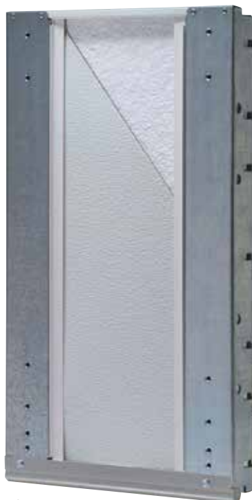
Optional polystyrene insulation sealed between door panel and embossed steel backing cuts heating/cooling cost.

Contact Wayne Dalton for additional sizes and colors.