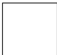
White Flush Finish