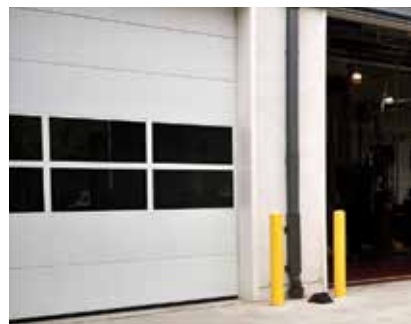
Full view sections allow for maximum natural light and visibility