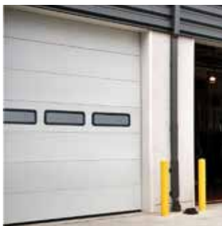
Insulated Lites allow for visibility while maintaining security